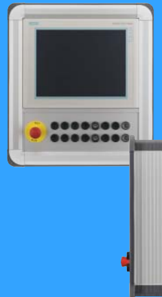
Version 3: Encapsulation with double-row control panel