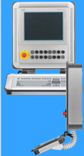
Version 4: Encapsulation with double-row control panel and attached keyboard