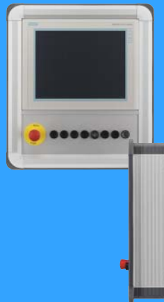
Version 2: Encapsulation with single-row control panel