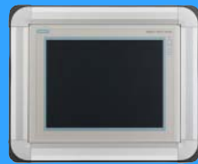
Version 1: Encapsulation